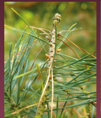
After watering in July, branches with dieback on tips got a new generation of needles, sprouting from adventive buds, in August. It adds more leaf area for aesthetic appearance and the production of ecosystem services, particularly in the